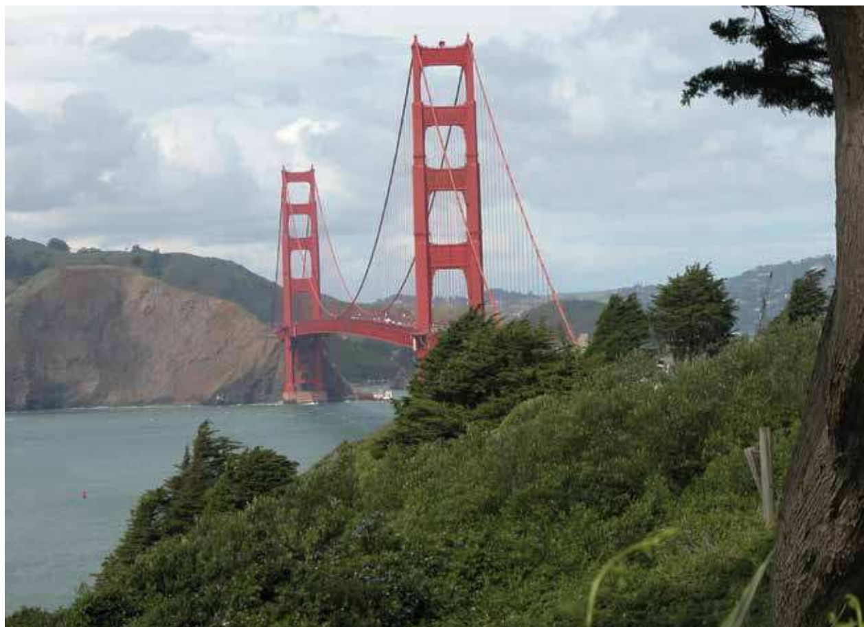
San Francisco will be the site of the ACP Annual Session from Nov. 1-4.