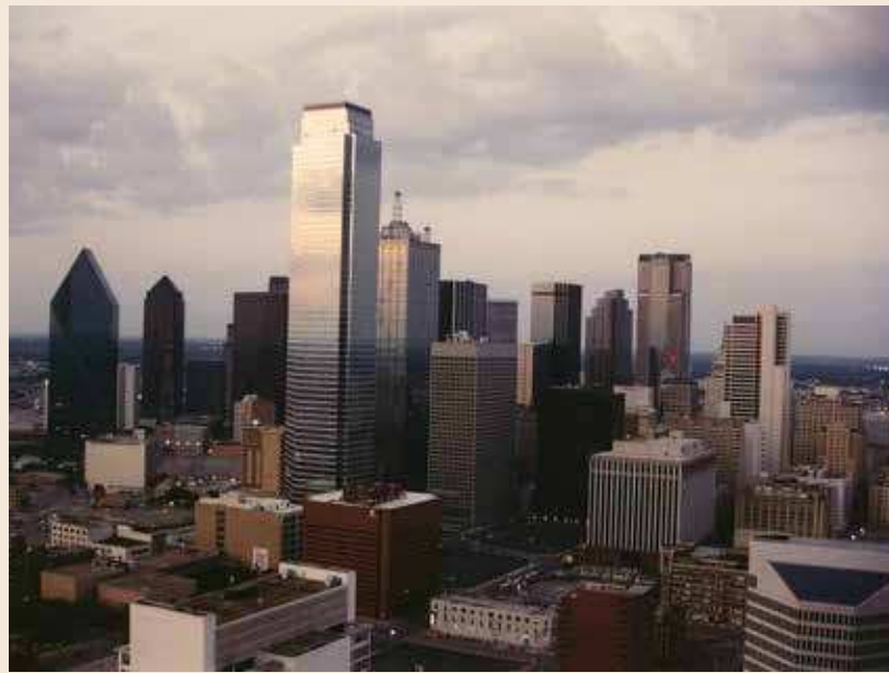
Dallas will be the site of the inaugural Glidewell Dental Symposium in November.

Glidewell Dental is an ADA-CERP recognized provider and an Academy of